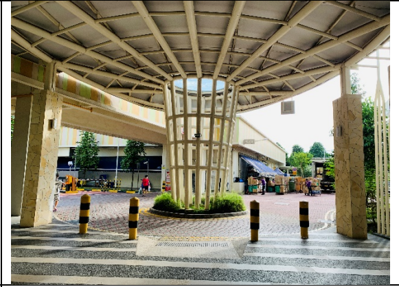
Drop-Off Point B (with covered walkway to Gate 4)

For the safety of the children, parents are reminded to refrain from dropping your children along the road.