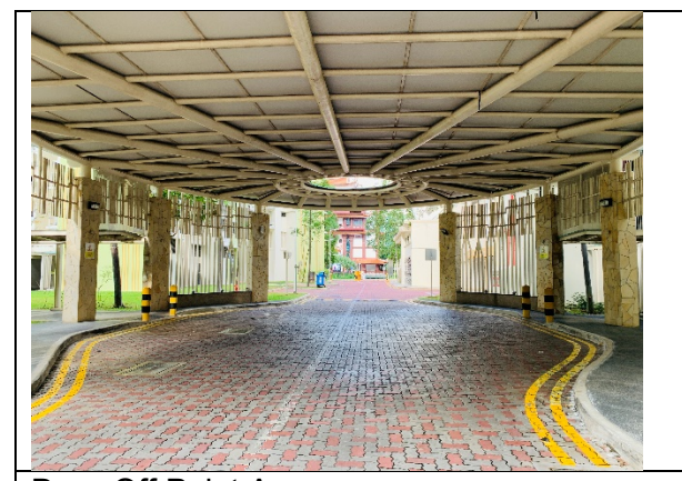
Drop-Off Point A (with covered walkway to Gate 2)